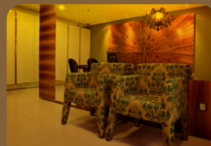
Klang Valley, Malaysia