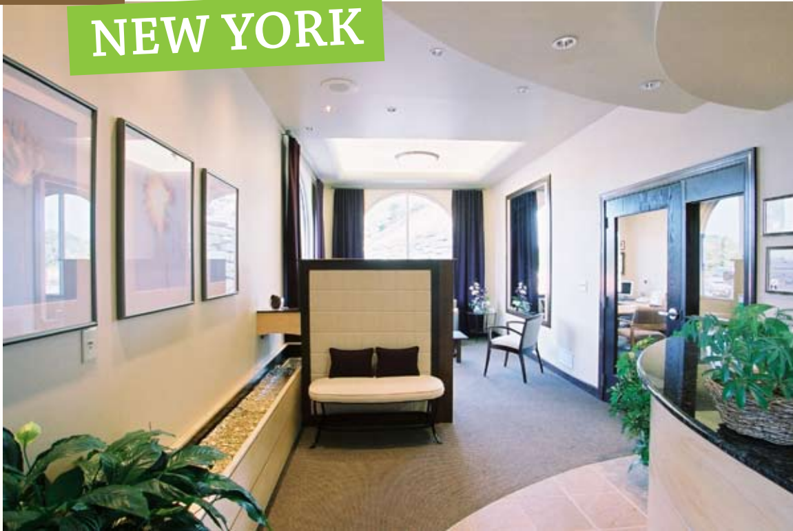
Curves in the profiled ceiling are echoed in the reception counter and floor design. Together with punctuations such as the seating fixture, these elements help to break the corridor up into pleasantly proportioned and less intimidating spaces