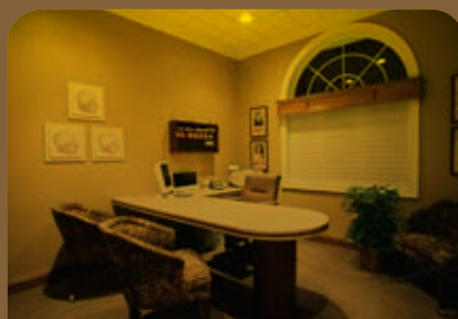
Johnson City, New York